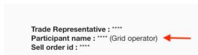
Image 2 – Grid operator is shown when the order is traded with GOPACS